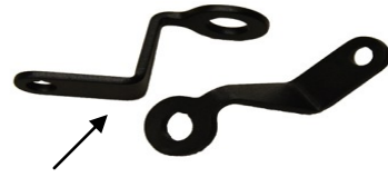
Turn signal relocation mounts

Mount the turn signal bracket to the original turn signal mount using the 8x25mm bolts & 8mm nuts and then mount the turn signals to this bracket. We suggest to drill two holes (one on each side) and guide the wires through the fender. If the bracket touches the fender, you may add the included washers to space between the provided turn signal mount and the original turn signal mount.