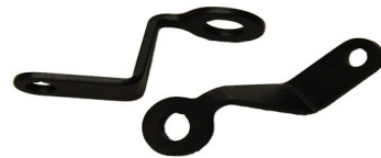
Turn signal bracket